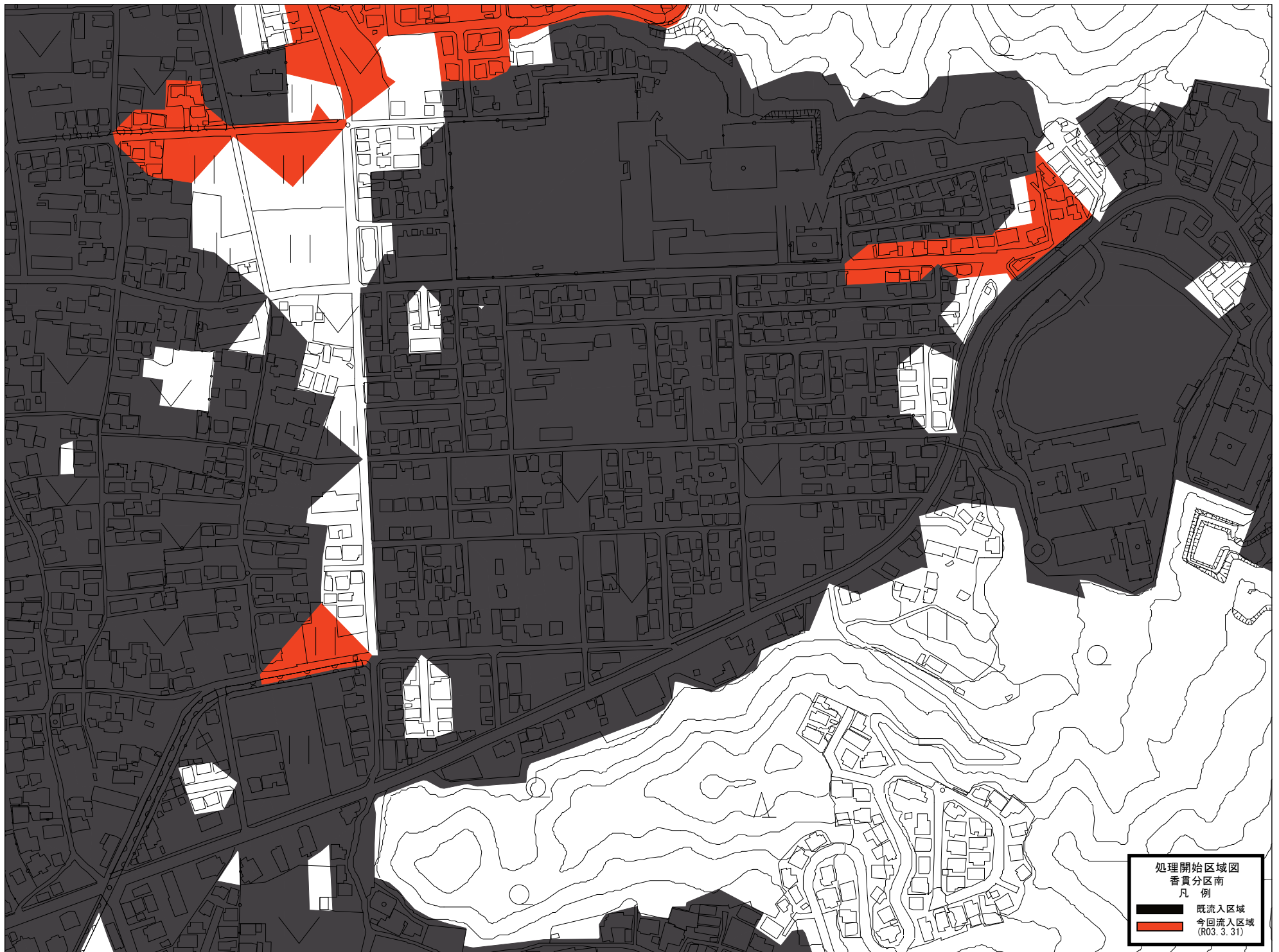
[ 香貫分区南 ]