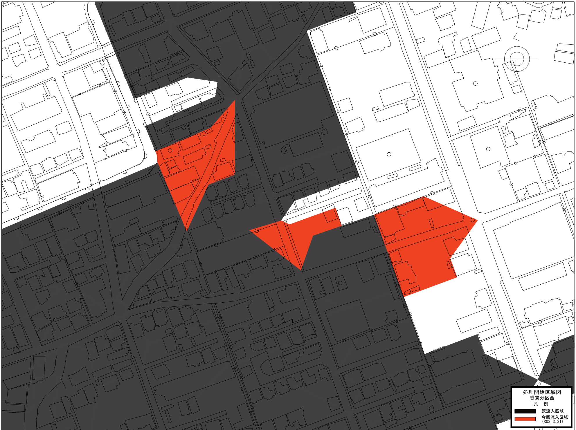
[ 香貫分区西 ]