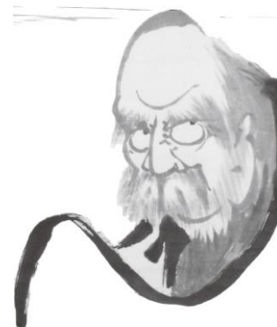
[“Daruma” drawn by Hakuin]