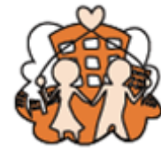
Certification Mark for Gender Equality Promotion Organization by Numazu