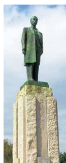
←Statue of Ebara Soroku (Ebara Soroku Sensei Memorial Park)

there. Even after Numazu Military School was closed, establishing Shuseisha (present Dai-1 elementary school), Sunto girls' high school (present Numazu Nishi high school) and others, Soroku devoted his energy to the development of education in Numazu. He also worked on industrial promotion; he started western-style livestock farming, keeping cattle and sheep in Mt. Ashitaka , and cultivated tea trees, starting the business of exporting tea leaves to America. Having succeeded in persuading the government into giving up the nationalized land in Ashitaka to the local farmers is one of his remarkable services as well. In addition, Soroku played a great role as statesman for a long time after he was elected as one of the members of the House of Representatives, which took place when the Diet was convened for the first time in Japan. At the place where Soroku's resident used to stand, Meiji Historical Museum was built and it has been exhibiting the historical materials Soroku had left behind, and handing down his contribution.