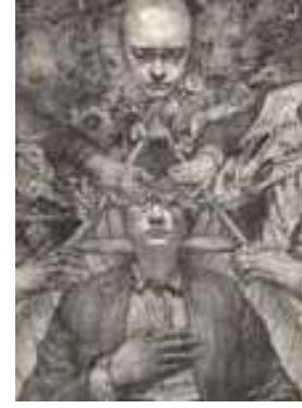
「Heibonna Nichijou no Danpen (A Piece of Normal Life)」 Silk Screen, 85 x 127cm