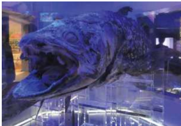
<Coelacanth at Numazu Deep Sea Aquarium>

There are various kinds of deep sea creatures living in Suruga Bay, the deepest bay in Japan. The maximum depth is 2,500 meters. About 1,000 kinds of fishes are said to live in the bay, though it is a world of complete darkness which the sun light can't reach. We call fish living at the depths of over 200 meter "Shinkaigyo (deep sea creatures)." In order to live in an ultimate environment of high pressure and low temperature, they have developed into very unique shapes.